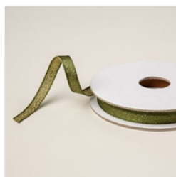
Mossy Meadow & Gold 1/4" (6.4 Mm) - 166158