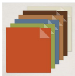
Weekend Adventures 12" X 12" (30.5 X 30.5 Cm) Two-Tone Cardstock - 167324

Julia Sager julia@julasuesstamping.com JuliaSuesStamping.com