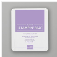
Highland Heather Classic Stampin' Pad - 147103