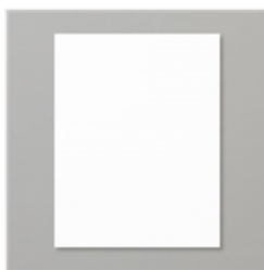
Basic White 8-1/2" X 11" Thick Cardstock - 159229