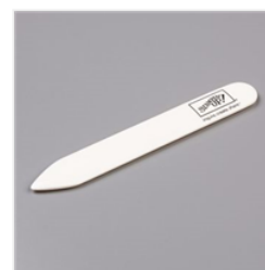
Bone Folder - 102300