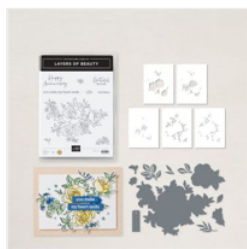
Layers Of Beauty Bundle (English) - 163519