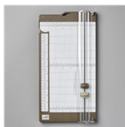
Paper Trimmer - 152392