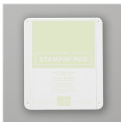
Soft Sea Foam Classic Stampin' Pad - 147102