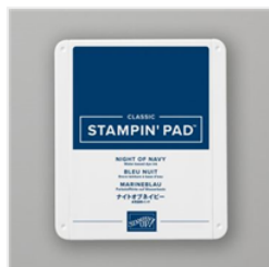
Night Of Navy Classic Stampin' Pad - 147110