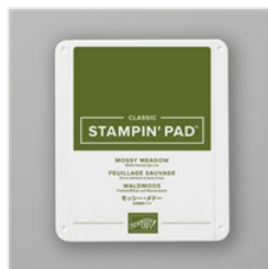
Mossy Meadow Classic Stampin' Pad - 147111