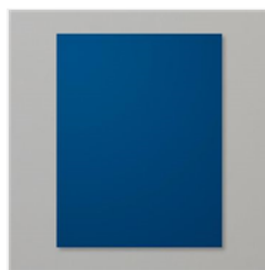
Night Of Navy 8-1/2" X 11" Cardstock - 100867