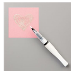
Wink Of Stella Clear Glitter Brush - 141897