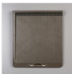
Simply Scored Scoring Tool - 122334