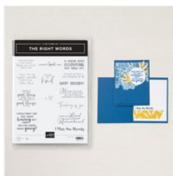
The Right Words Cling Stamp Set (English) - 165316