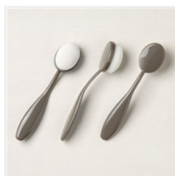
Blending Brushes - 153611