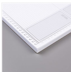
Grid Paper - 130148