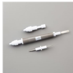
Take Your Pick - 144107