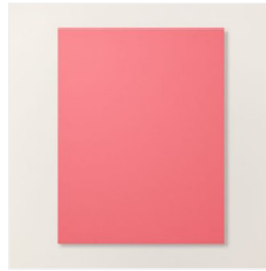
Strawberry Slush 8-1/2" X 11" Cardstock - 165625