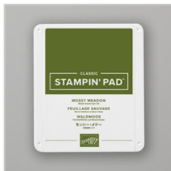
Mossy Meadow Classic Stampin' Pad - 147111