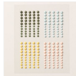
Muted Palette Dots - 165155