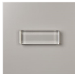
Clear Block H - 118490