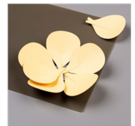
Silicone Craft Sheet - 127853