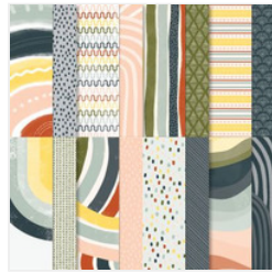
Boho Vibes 6" X 6" (15.2 X 15.2 Cm) Designer Series Paper - 165144