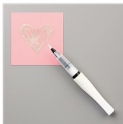
Wink Of Stella Clear Glitter Brush - 141897