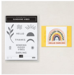
Sunshine Vibes Photopolymer Stamp Set (English) - 165146