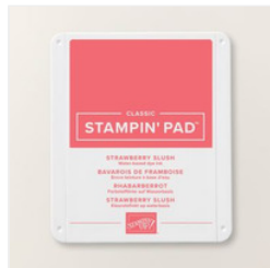
Strawberry Slush Classic Stampin' Pad - 165286