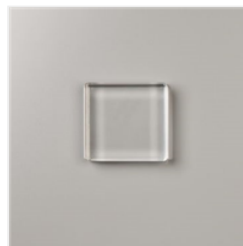
Clear Block D - 118485