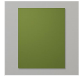
Mossy Meadow 8- 1/2" X 11" Cardstock - 133676