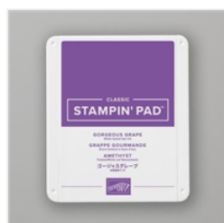
Gorgeous Grape Classic Stampin' Pad - 147099