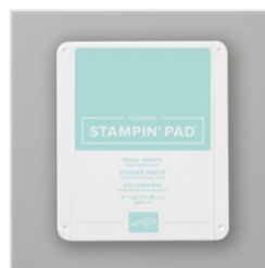
Pool Party Classic Stampin' Pad - 147107