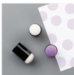
Sponge Daubers - 133773