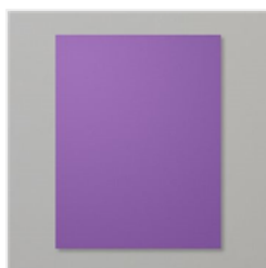
Gorgeous Grape 8-1/2" X 11" Cardstock - 146987