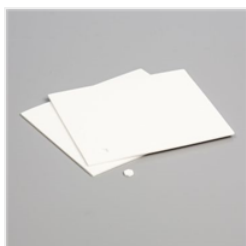
Mini Stampin' Dimensionals - 144108