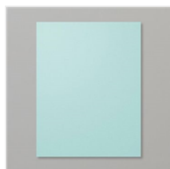
Pool Party 8-1/2" X 11" Cardstock - 122924