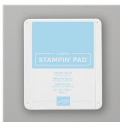
Balmy Blue Classic Stampin' Pad - 147105