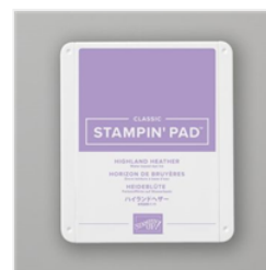
Highland Heather Classic Stampin' Pad - 147103