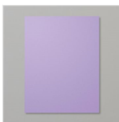
Highland Heather 8-1/2" X 11" Cardstock - 146986