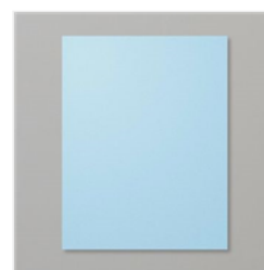
Balmy Blue 8-1/2" X 11" Cardstock - 146982