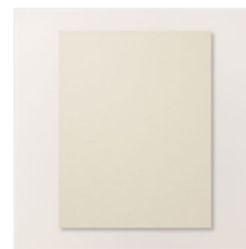
Basic Beige 8-1/2" X 11" Cardstock - 164511