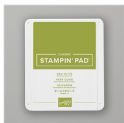
Old Olive Classic Stampin' Pad - 147090