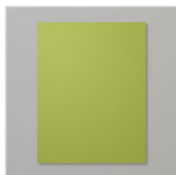
Old Olive 8-1/2" X 11" Cardstock - 100702