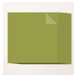
Old Olive 12" X 12" (30.5 X 30.5 Cm) Two-Tone Cardstock - 166683