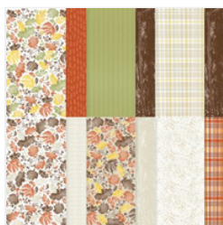
Gathering Together 12" X 12" (30.5 X 30.5 Cm) Specialty Designer Series Paper - 165969