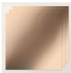
Earthen Toned Metallic 12" X 12" (30.5 X 30.5 Cm) Specialty Paper - 165901