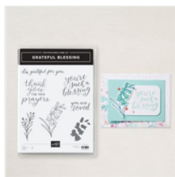
Grateful Blessing Photopolymer Stamp Set (English) - 163689