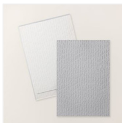
Gathering Leaves Embossing Folder - 165983