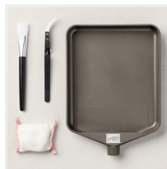
Embossing Additions Tool Kit - 159971