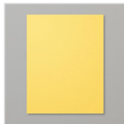
Daffodil Delight 8-1/2" X 11" Cardstock - 119683