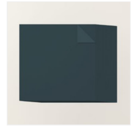
Secret Sea 12" X 12" (30.5 X 30.5 Cm) Two-Tone Cardstock - 166709