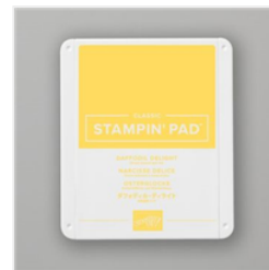
Daffodil Delight Classic Stampin' Pad - 147094