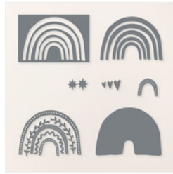
Sunshine Vibes Dies - 165151