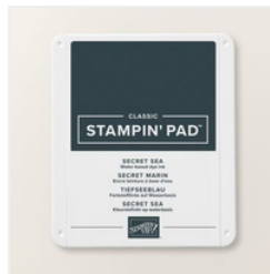
Secret Sea Classic Stampin' Pad - 165285