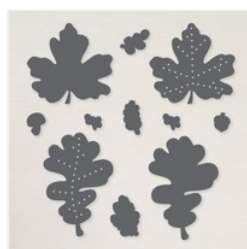
Gathering Moments Dies - 165979