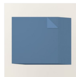
Misty Moonlight 12" X 12" (30.5 X 30.5 Cm) Two-Tone Cardstock - 166686