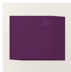
Blackberry Bliss 12" X 12" (30.5 X 30.5 Cm) Two-Tone Cardstock - 166678