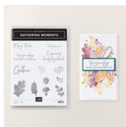
Gathering Moments Cling Stamp Set (English) - 165970