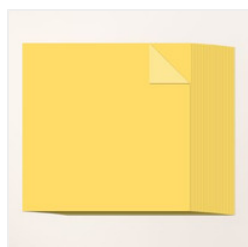
Daffodil Delight 12" X 12" (30.5 X 30.5 Cm) Two-Tone Cardstock - 166669